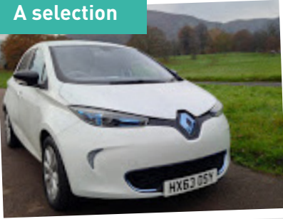
Renault Zoe (Electric)