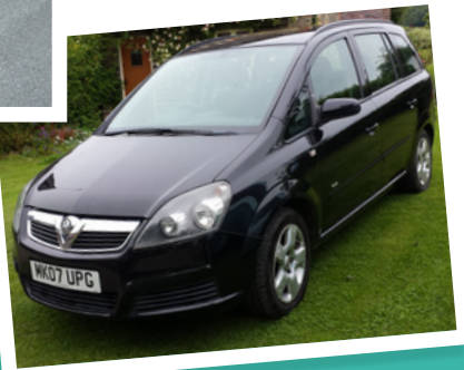
7 Seater Zafira

malvern hills-carclubs.org.uk 01684 540284