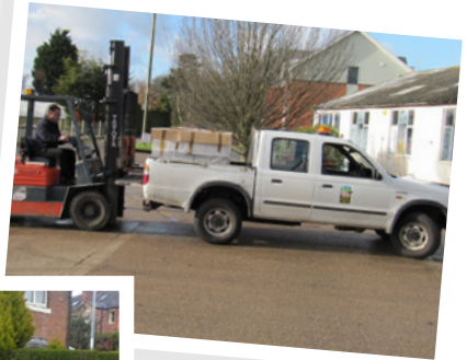
4x4 Pickup (5 Seater)